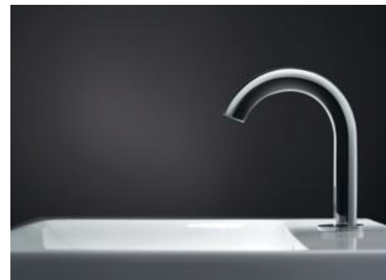
↑ The Geberit tap system also includes deck-mounted models, which feature a tall, slim tap housing and therefore offer optimum ergonomics and hygiene when washing your hands. Pictured: Geberit Piave deck-mounted tap.