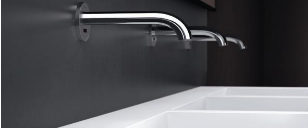
↑ Elegant wall-mounted taps, clean washbasins and plenty of room between them to wash your hands. This is what architects and their clients often have in mind when they are planning public or semi-public sanitary facilities. This vision can now easily be turned into reality. Pictured: Geberit Piave wall-mounted taps.

Geberit tap system for public sanitary facilities