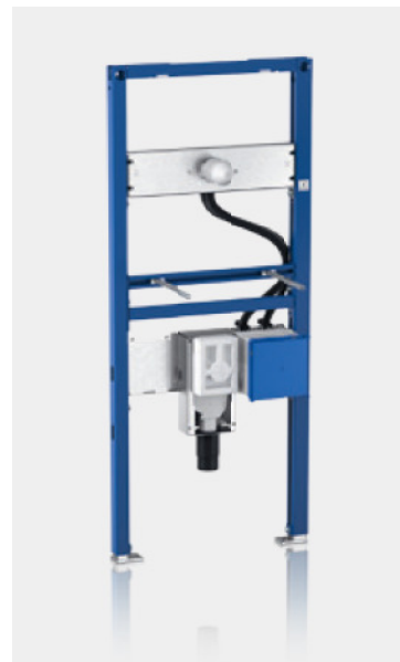
← A Geberit Duofix installation element for washbasins, prepared for holding a wall-mounted tap. The function box for the control electronics, mixer and power supply is located on the bottom right, and the ready-to-connect concealed trap in the middle. The integration of the taps into the Geberit system technology gives everyone involved a high degree of planning security.

With its new tap system, Geberit is helping to bring about a change in thinking – electronic taps can be slim and elegant and still be very robust. They can also be installed in the wall quickly and without any errors at the first attempt.