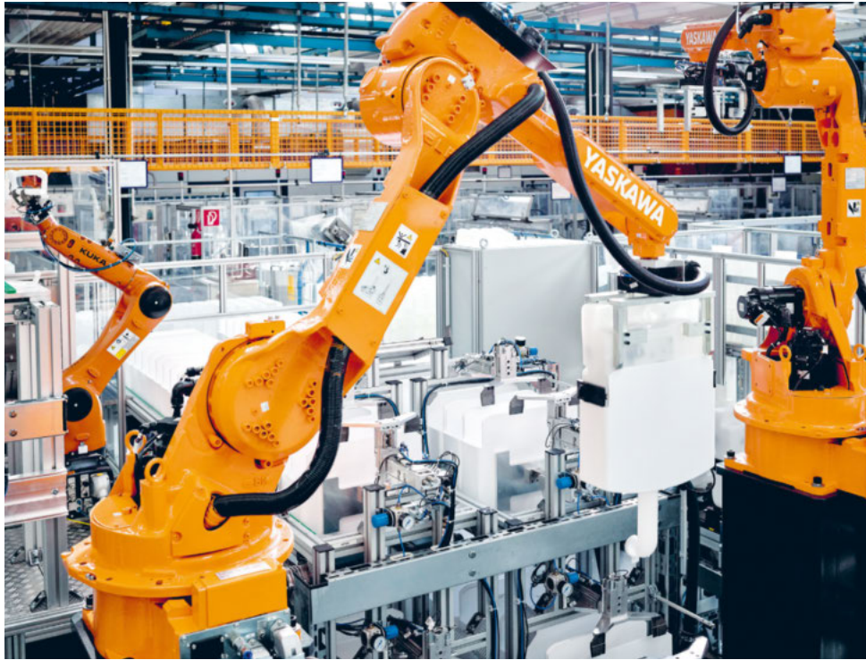
↑ Concealed cisterns are assembled on the new production line in Pfullendorf.