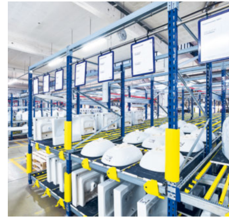
The new “supermarket” in the Gaeta ceramics plant. ↓

The investment volume in Pfullendorf totals EUR 14 million.