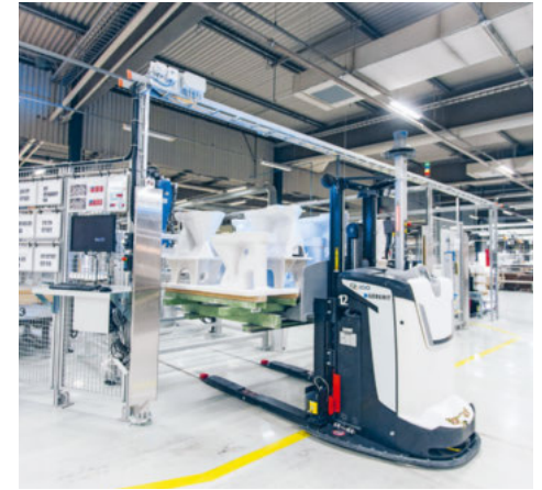
Thanks to the optimised flow of materials, the Ekenäs ceramics plant looks tidy at all times. ↓

The investment volume in Gaeta totals EUR 0.2 million.